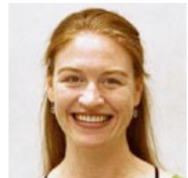
If You Go